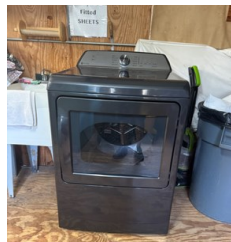
New Dryer at the camp