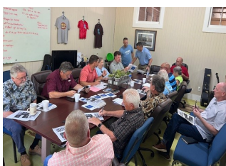
Camp Harris Ex. Board Meet.